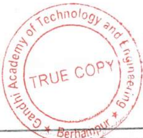
Principal Gandhi Academy of Technology and Engineering, Berhampur

The Governing body has recommended providing the TA-DA amount and the registration fees as claimed by the faculties, subject to the maximum limit of disbursement band, as decided by the Governing body. The governing body is pleased to provide a sum of rupees 7000/- to each faculty for attending conference/workshop etc.