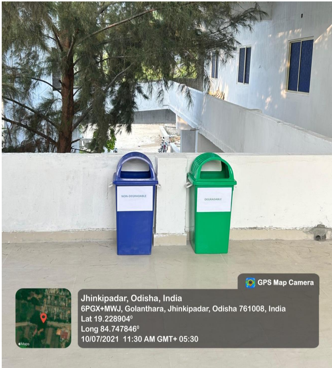
Management of the various types of degradable and non-degradable waste by use of dustbins in different location of institute