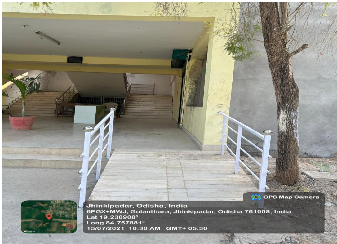
Disabled-friendly, barrier free -RAMP