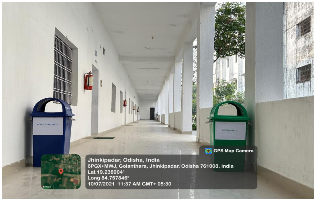
Management of the various types of degradable and non-degradable waste by use of dustbins