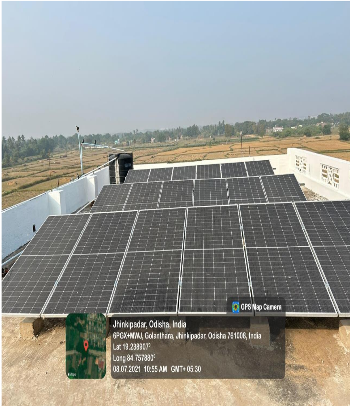
Alternate sources of energy (Solar PV cell)