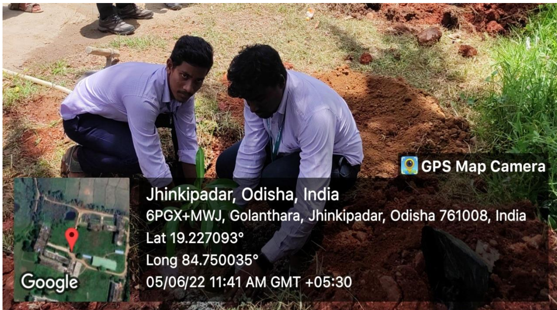
Plantation Program on institute Campus