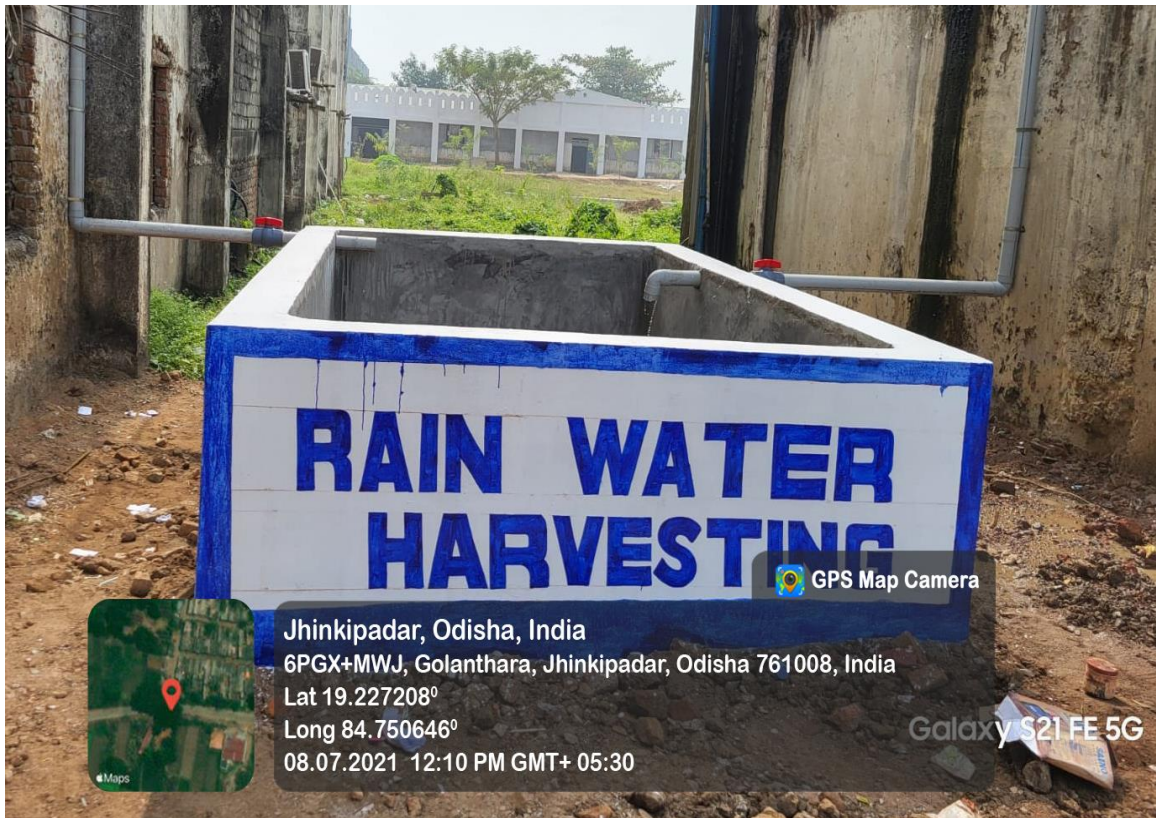
Rain water harvesting facility in institute