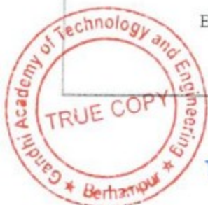
Principal Gandhi Academy of Technology and Engineering, Berhampur

Environmental Policy - Gandhi Academy of Technology and Engineering (Policy no: GATE-02)